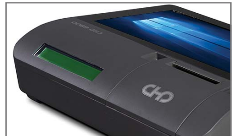
CUSTOMER DISPLAY, 240 x 48 dot