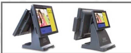
VARIETY OF PERIPHERALS