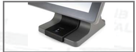
FINGERPRINT & IBUTTON SELECTABLE