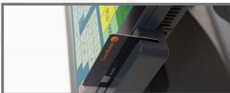
MAGNETIC STRIPE CARD READER