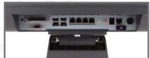
STAND WITH ADAPTER HOUSING

Asia headquarters: CHD ASIA PTE. LTD., 3791 Jalan Bukit Merah #03-05, e-Centre, Singapore, 159471