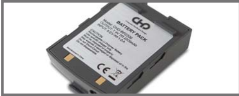
RECHARGEABLE Li-Ion BATTERY