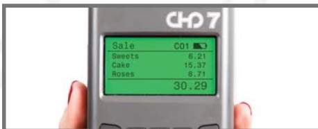
GRAPHIC LCD DISPLAY