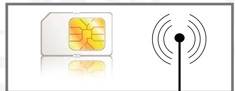
GSM / GPRS (OPTION)

Asia headquarters: CHD ASIA PTE. LTD., 3791 Jalan Bukit Merah #03-05, e-Centre, Singapore, 159471